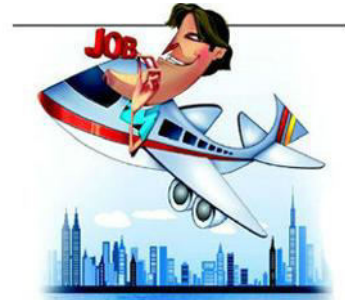
AAI has installed whole lot of new CNS facilities -- 15 Instrument Landing System ILS, 13 radars, 38 ATS Automation systems.

The Guild says there is a need for around 1,200 additional personnel.