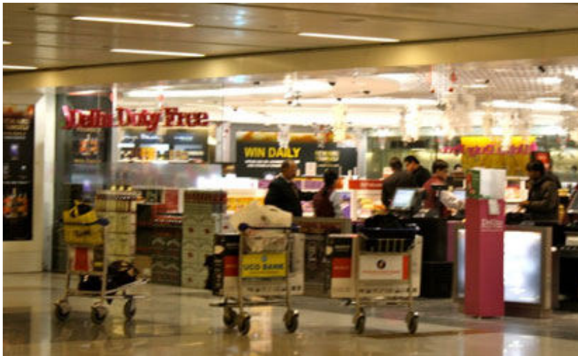
The CNS executives are overburdened and are under tremendous stress and fatigue.